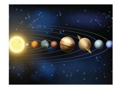
The Sun is a star at the centre of our solar system.

There are 8 planets in our solar system: Mercury, Venus, Earth, Mars, Jupiter, Saturn, Uranus and Neptune.