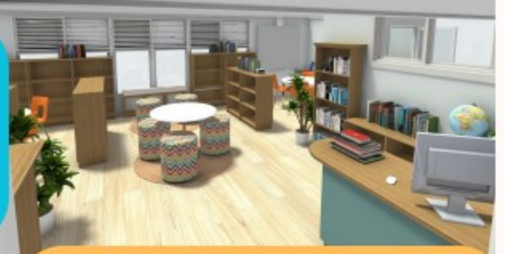
Create a real sense of entering a library, with entrance desk for book returns and new selections

Use the space fully as a library and research resource to enable the use of all the available books