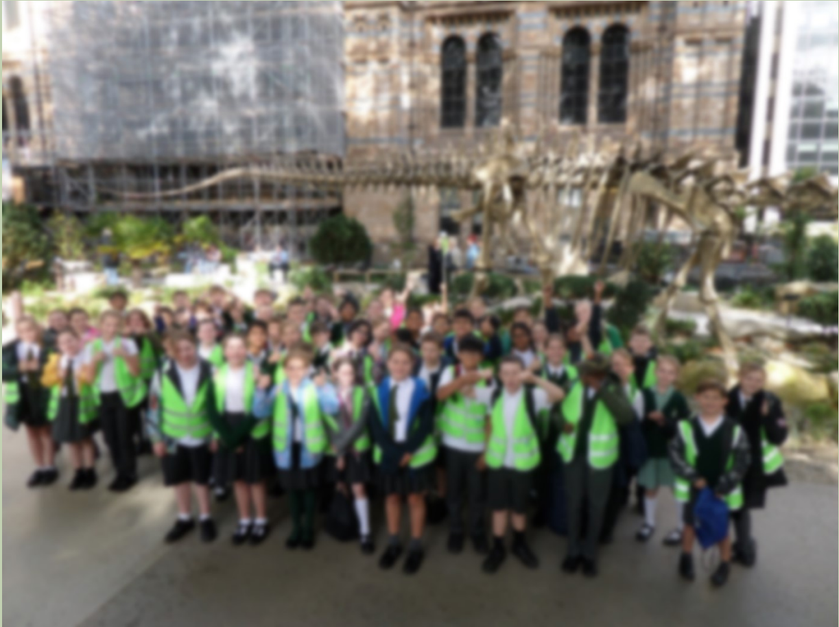
Please note, this photo has been blurred for GDPR purposes.