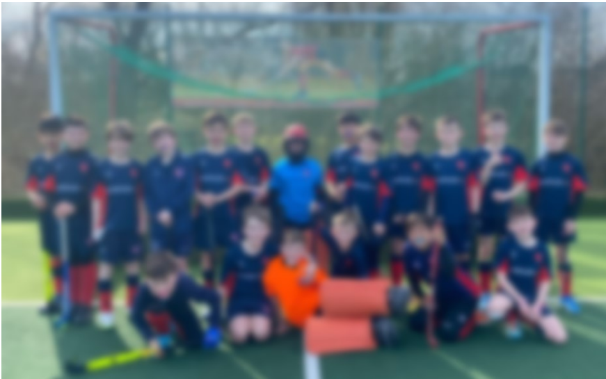
Please note, this photo has been blurred for GDPR purposes